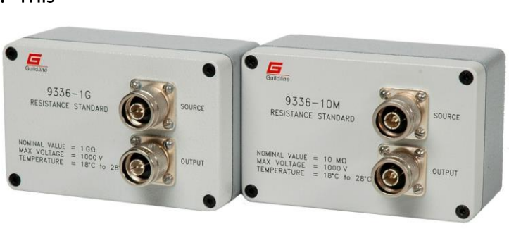
Figure 1 - 9336 Series

primary level Direct Current Comparator Bridge or Teraohmeter and an air bath. This ensures that the resistance standard meets the published temperature coefficient specification over the standards recommended range. For example at 10 M \Omega , with a wide laboratory environment of 23 °C with control to ± 3 °C, the worse case effect due to temperature will be 15 ppm!