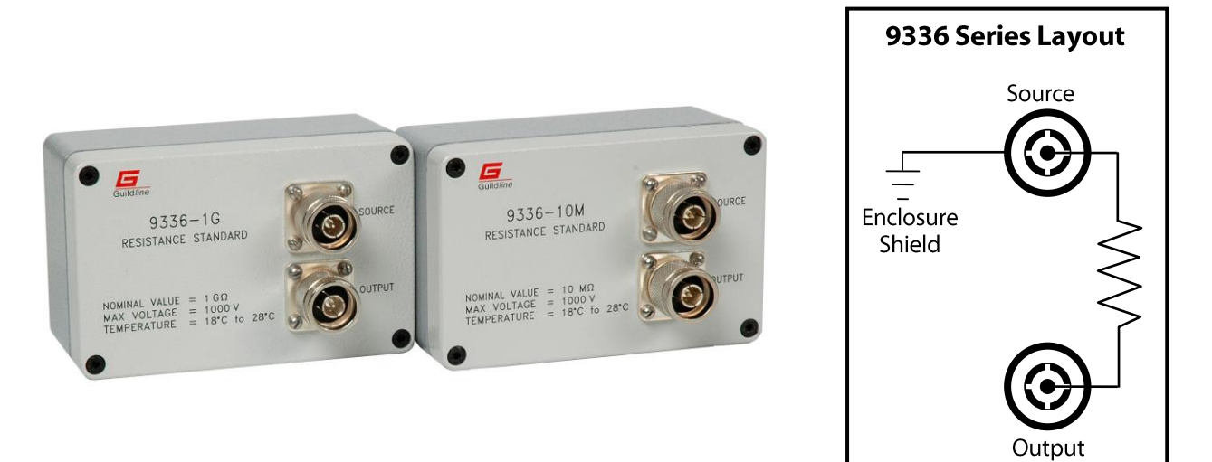
Figure 3 - 9336 Series from 1 M\Omega to 100 G\Omega

In the case of the 6530 TeraOhm Bridge-Meters, 6520 and 6500(A) Digital Teraohmmeters - the "SOURCE" terminal connects to the high voltage output connector and the "OUTPUT" terminal connects to the electrometer input. If necessary, the temperature of the enclosure may be monitored and a correction factor applied to the value of the resistance.