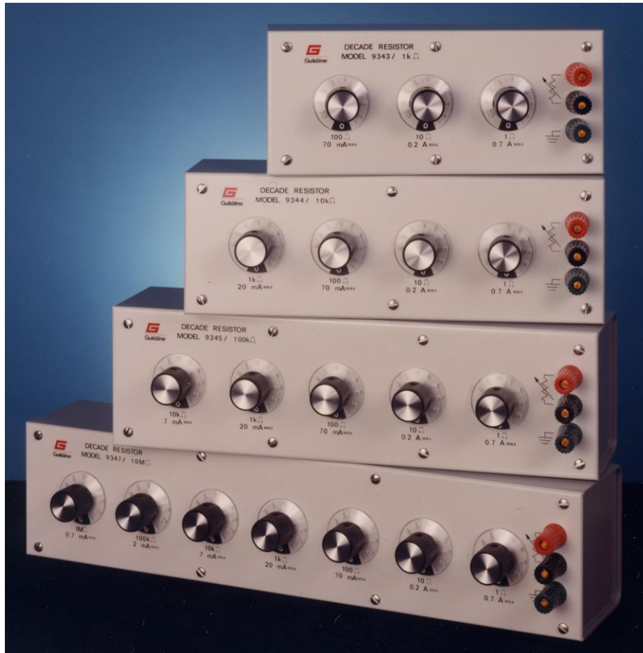
Figure 1-1: 9340 Series of Resistance Decade Boxes

The Model 9340 is a Family of Precision Decade Resistance Boxes. It combines techniques established at Guildline in the construction and stabilizing of resistors, and low uncertainty switching techniques used in many of our instruments. The Model 9340 Series is available in decade range of from 3 to 7 decades. Each range is available in the full resistance range of from 0.01 \Omega steps to 1 T \Omega steps.